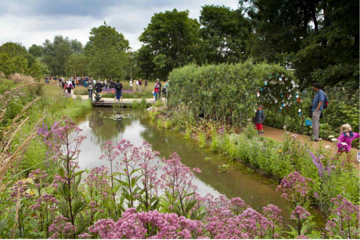
The Queen Elizabeth Olympic Park, located in East London and a formerly deprived area, has been at the heart of a major urban regeneration plan, in view of the 2012 Olympic Games. Photos show parts of the area before and after the regeneration.