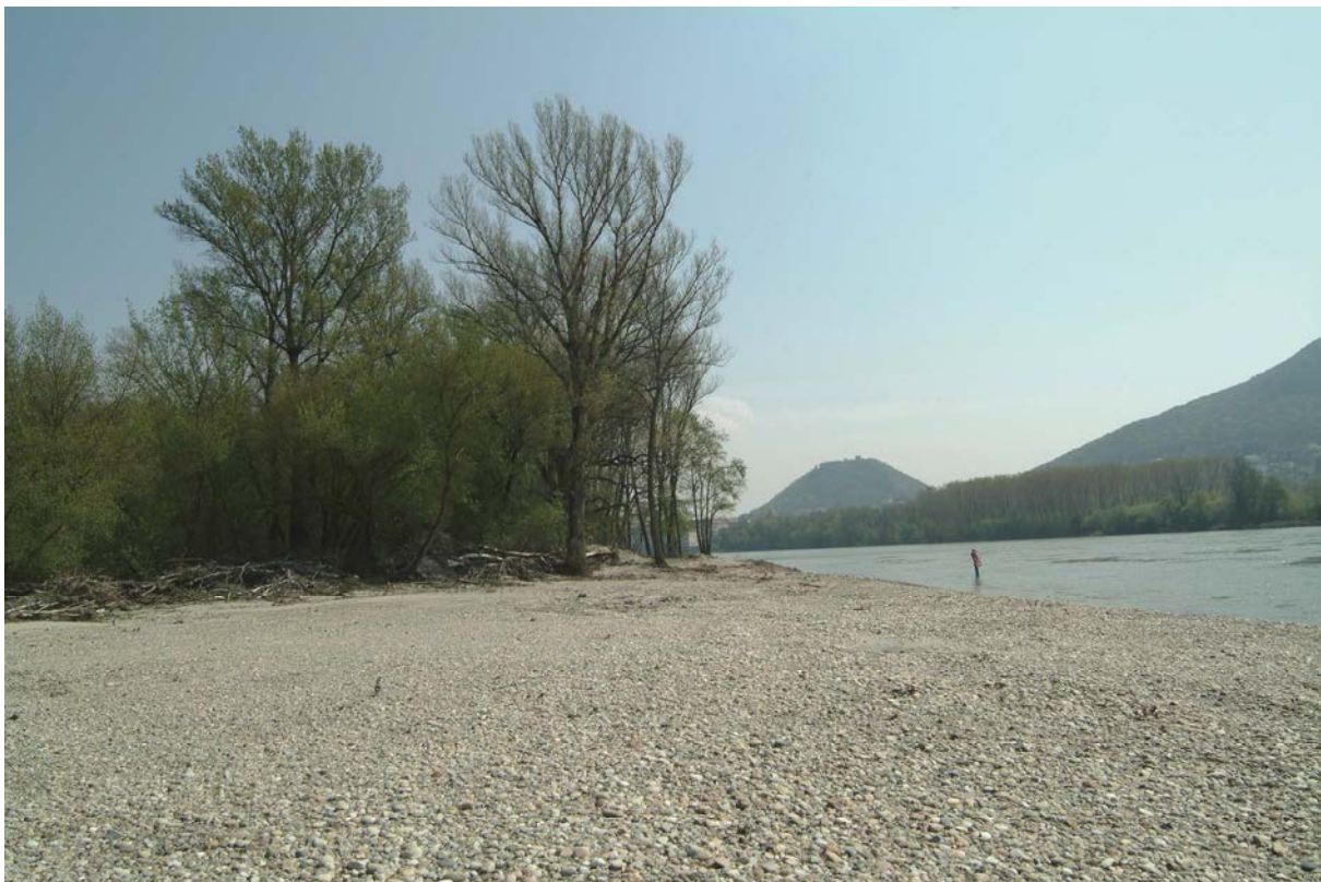
The restoration of the natural dynamics of a Danube floodplain to the east of Vienna was aimed at protecting riverine habitats and species but also at moderating floods and droughts. Photos show the floodplain before and after the hydrological restoration, which included the removal of all artificial elements to generate a natural river bank structure