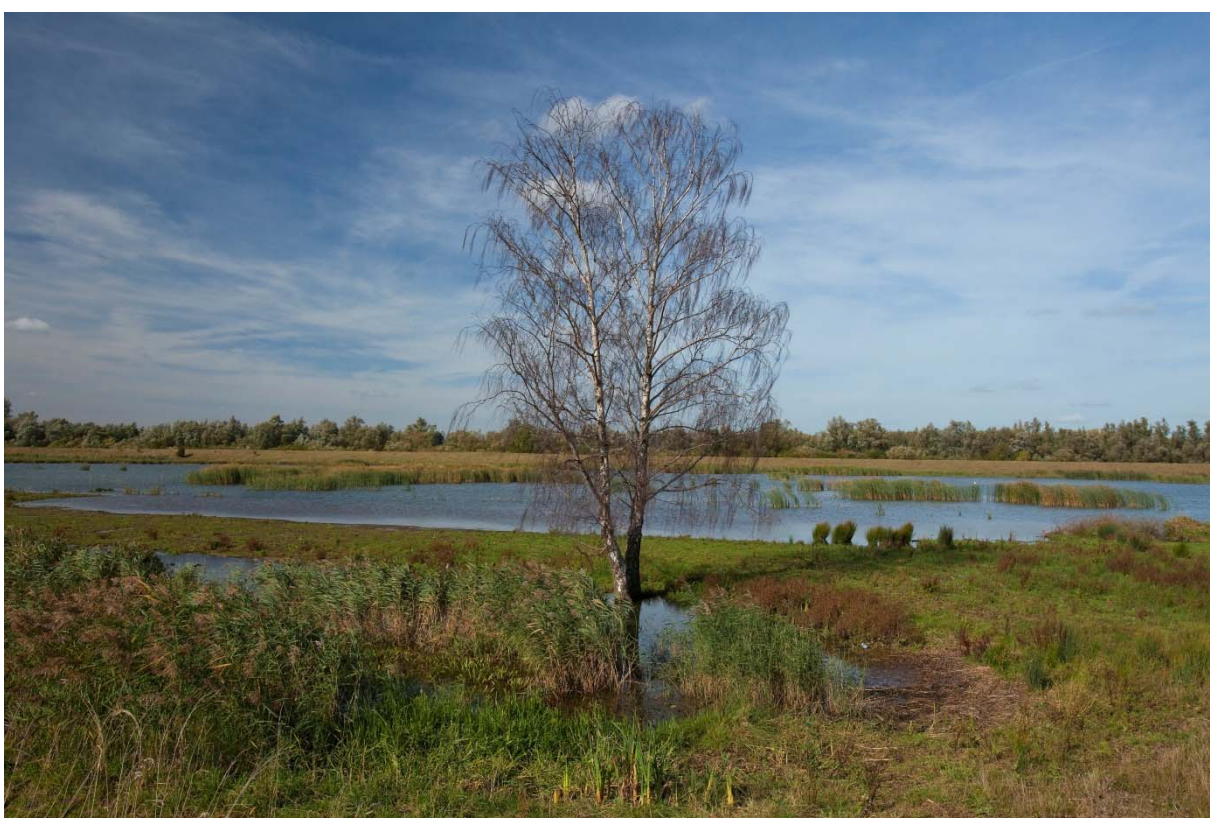
The restoration of the floodplain of the Noordwaard polder, the Netherlands, will provide climate change-related flood protection, improve the environmental quality for people and nature, increase recreational facilities and boost the economy. Both photos show the situation after depoldering, which has left more room for the river.