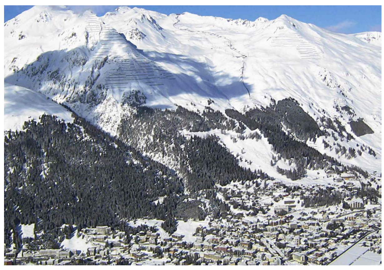
Improved protection against natural hazards, including avalanches, through intentional afforestation, adapted forest management (densification) and additional technical measures in Parsenn (Switzerland) between 1945 and 2007